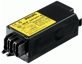
SND 88 & 89